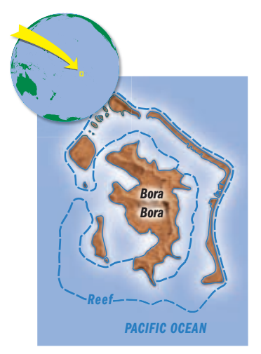
Only six miles long. Bora Bora is one of the "Society Islands" of French Polynesia in the South Pacific.