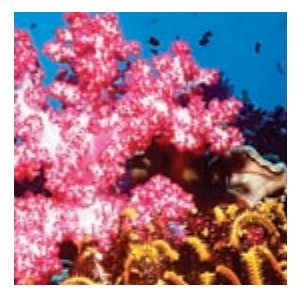
coral (kôr'əl) n. a type of marine animal, the skeletons of which build up a rocklike underwater structure called a reef