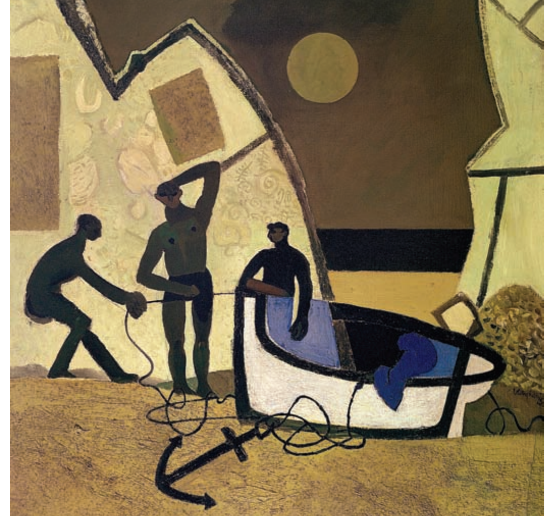
Detail of Fishermen, Finisterre (1951), Keith Vaughan. Oil on canvas, 91.4~\rm cm \times 71.1~cm . Private collection. © Bridgeman Art Library. © 2008 Artists Rights Society (ARS), New York/DACS, London.

"What of my father?" the boy asked quickly. And now he sat up straight on the mats.