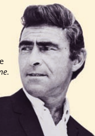
Author Online Go to <u>thinkcentral.com</u>. KEYWORD: HML7-139

as prejudice and intolerance. "The Monsters Are Due on Maple Street" first appeared in 1960 as an episode of The Twilight Zone .